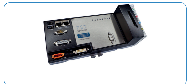
Picture 1: The control unit of the Positioning Solution System offers all the usual interfaces needed for connecting to the company's IT, processing computers or PLC as well as a scalable number of I/O modules for direct connection to distance meters like lasers, incremental encoders or barcode readers.

The Positioning Solution System is a control unit in the form of a compact industrial PC, which provides numerous interfaces and connecting modules which are conform to industry standards (see picture 1) and a communication interface and